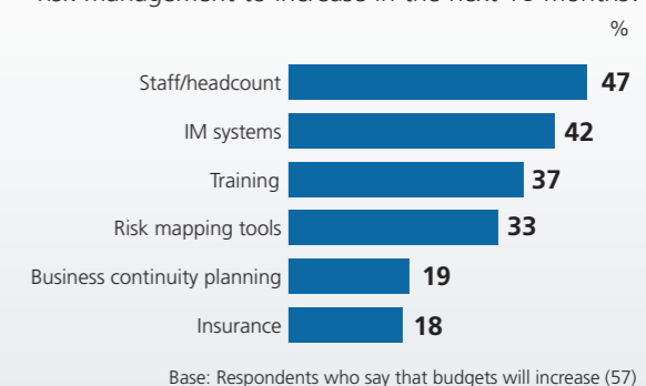
Figure 3: In what areas do you expect the budget for risk management to increase in the next 18 months?

The consensus view is that the global financial crisis has revealed a breakdown of certain risk management controls in financial institutions. Recognising this, and in an effort to pre-empt government intervention and mitigate the impact of new regulations, these organisations are set to invest more in improving their overall risk management frameworks in order to avoid similar problems in the future and restore stakeholder confidence.